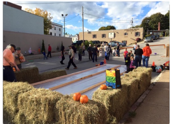
Pumpkin bowling was a highlight of the harvest-themed Third Thursday in October.