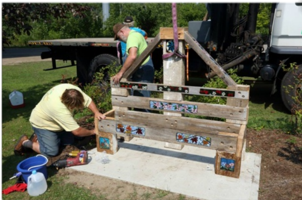
Art benches were installed along the Canal.

"We can never get re-creation of community and heal our society without giving citizens a sense of belonging." – Patch Adams