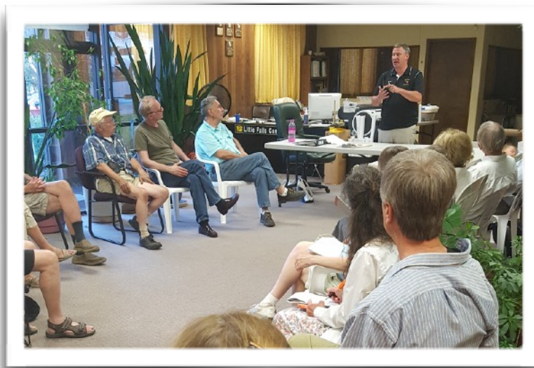
MSF Clubhouse - 690 E Main Street