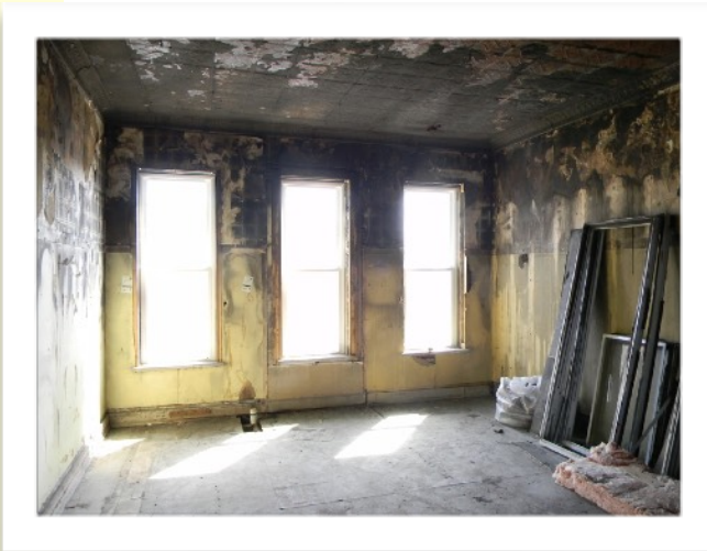
Before and after images of the new apartment on the second floor at 584 Main Street.